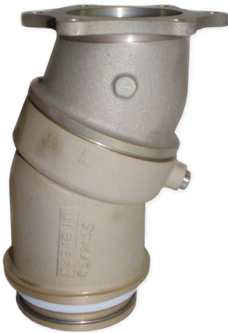
D-3 Inlet Coupling

Older Model 64349 nozzles (D-1 or D-2) may be badly worn at the body swivel joint and it may not be possible to get a leak tight fit with the new D-3 universal coupling. Model 64349 nozzles with serial numbers 8200 and higher include a replaceable wire ball race ring and can safely be retrofitted with the D-3 inlet (after inspection of the wear ring to determine if replacement is needed). Eaton does not recommend retrofitting any Model 64349 nozzle that does not have a replaceable wire ball race ring in its inlet.